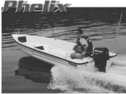
17' Bass Cat Phelix Boat & Trailer Donated by Bass Cat Boats of Mountain Home, AR